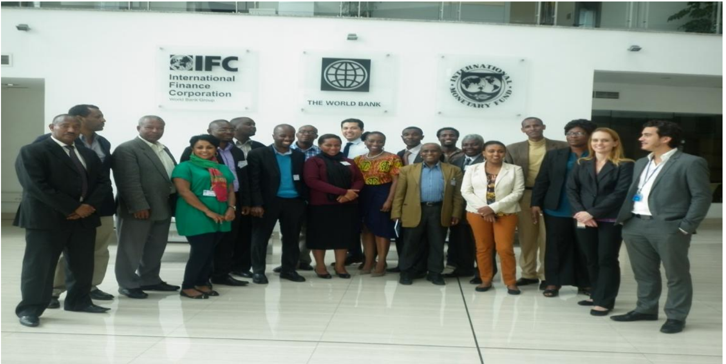
Group Photo of Participants and some Bank Staff after the workshop

Before the end of the workshop, there were interactive sessions where participants discussed the EITI challenges they needed knowledge on and the top issues to prioritize to catalyze CoP dialogue. There was also a roundtable Discussion on EITI Country Highlights where each country presented their EITI status, challenges, knowledge exchange needs. At the interactive discussions participants brainstormed the best Strategies to best engage their EITI colleagues back home. Participants also undertook Stakeholder mapping and identifying CoP interests of each. The climax of the two day workshop was the Online practice jam where separate groups took part in the first ever EITI online discussion in real time.